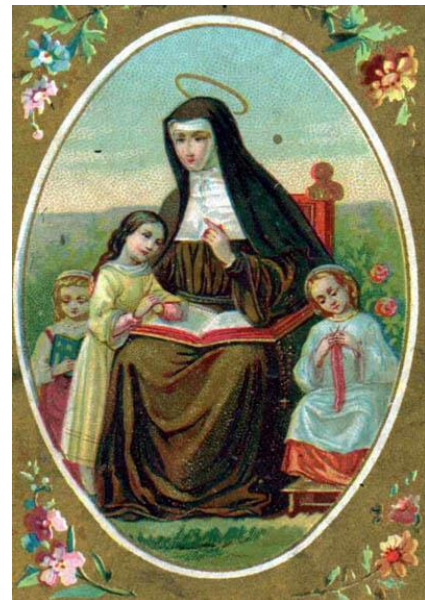
St. Angela Merici