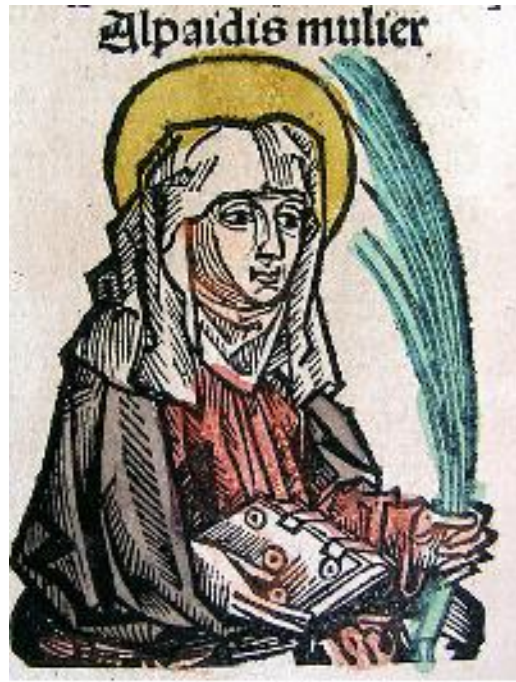
Alpais of Cudot