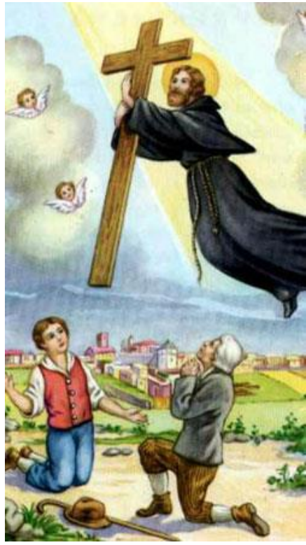
St. Joseph of Cupertino