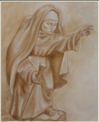
Blessed Margaret of Castello, Pray for us!