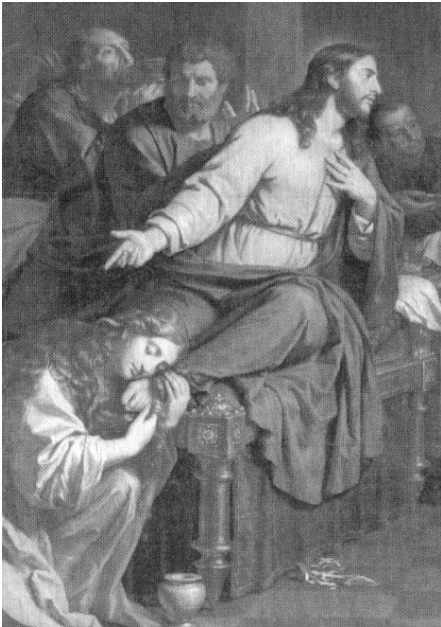
The Home of Simon the Pharisee by Phippe de Champaigne, 1602-1674