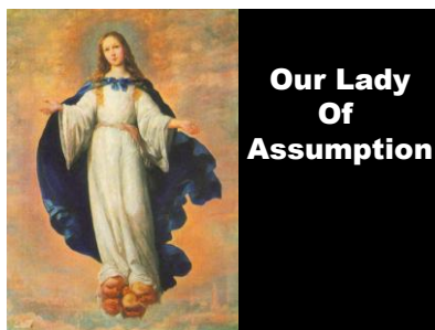
Our Lady Of Assumption

Mary and Joseph preserved her virginity throughout their marriage, choosing to accept the miraculous birth of Jesus as the fruit of their marital love. CCC 499: The deepening of faith in the virginal motherhood led the Church to confess Mary’s real and perpetual virginity even in the act of giving birth to the Son of God made man. In fact Christ’s birth, ‘did not diminish his mother’s virginal integrity but sanctified it.’ And so the liturgy of the Church celebrates Mary as Aeiparthenos , the “Ever-virgin.”