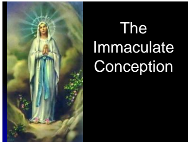
The Immaculate Conception

General Objective: Provide a basic understanding on what the Church teaches regarding the Holy Virgin Mary and popular religiosity.